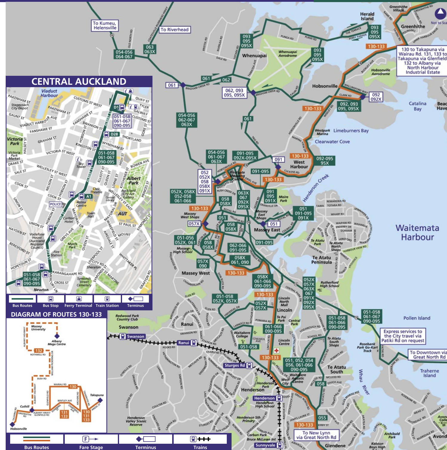
DIAGRAM OF ROUTES 130-133